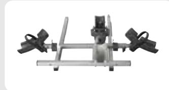
Third bike adapter

You can expand your Twinny Load at any time using the following accessories: Visit our website to explore the options per bicycle carrier.