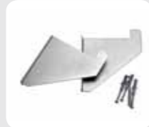
Universal wall mount