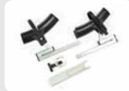
Child bike adapter

If you lose a Twinny Load part – no problem! You can order the part from your nearest Twinny Load sales point.