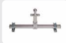
Caravan attachment: high/low